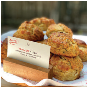
Caramelized Onions & Gruyère Scones