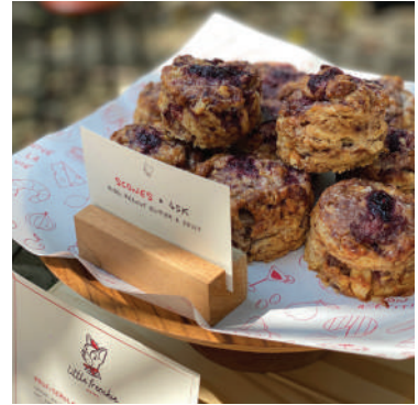
Miso Peanut Butter & Jelly Scones