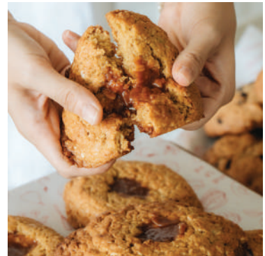
Salted Caramel Oatmeal Soft Baked Cookies