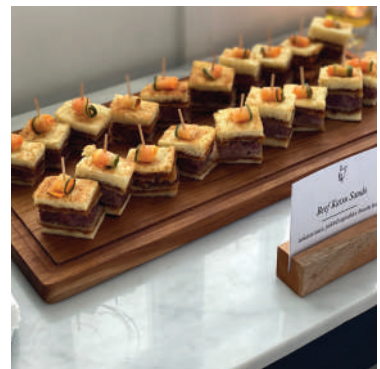
Beef Katsu Sando