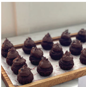
Chocolate Hazelnut Financiers