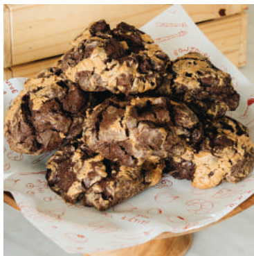
Dark Chocolate Peanut Butter Soft Baked Cookies