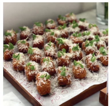
Jambon Beurre Croquette