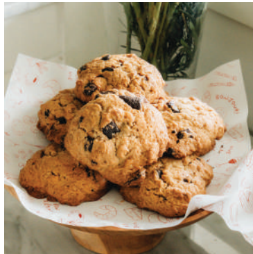
Chocolate Walnut Soft Baked Cookies