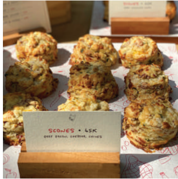
Bacon Cheddar Scones