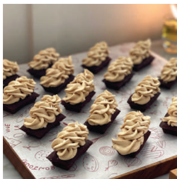
Chocolate Fudge Brownies